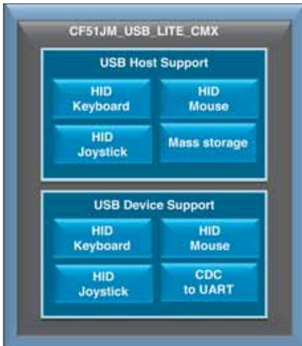
CMX USB stack

as either host or device in a connective partnership. For a quick snapshot of the USB specification, see table 1.0.