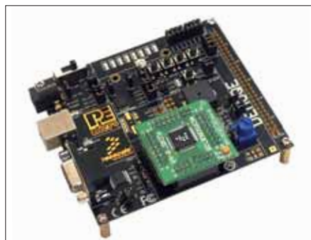
Low-cost development system designed for demonstrating, evaluating, and debugging

To help make the choice easier for designers, Freescale has launched a new series of micro-