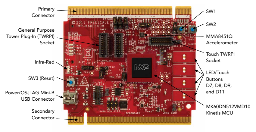
Figure 1: Front side of TWR-K60D100M module