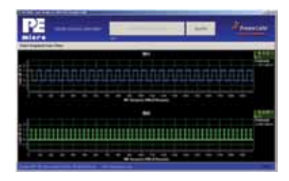
Figure 7. Showing Logic Analyzer interface used by DEMO9S08SC4 Application Demo to display the signal output from the MC9S08SC4 PTA1 port (IN0) and PTB5(IN1).