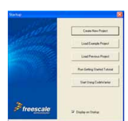
Figure 3. Showing startup dialog that appears when you start CodeWarrior. You can choose to Load Example Project from other various S08 devices.