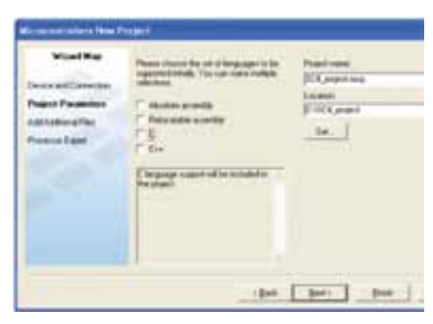
Figure 4. Showing the option to create a C/C++/Assembly base project.