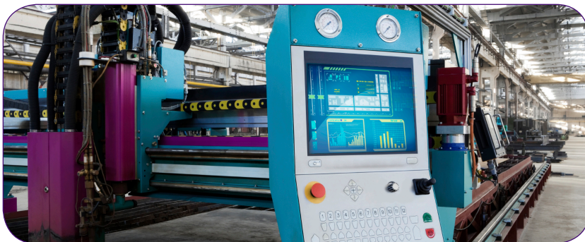
Figure 3: Example of HMI panel

HMIs are the perfect example of how the convergence of IT and OT systems is needed in the modern digital factory. HMI applications are often built with a Java SDK or using a web-based toolkit. This both speeds development of the applications and allows factory owners to easily upgrade processes across the entire factory. This requires connectivity to a typical IT network, enabling software updates to the HMIs, or providing constant connectivity to a webserver. However, these HMIs are used to control industrial machinery, often providing safety controls, so they must also interface to the OT domain.