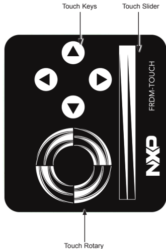
Figure 1: FRDM-TOUCH Callouts